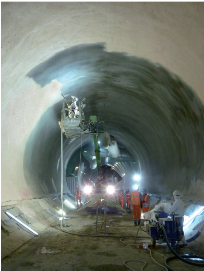
Application of MasterSeal 345 waterproofing membrane