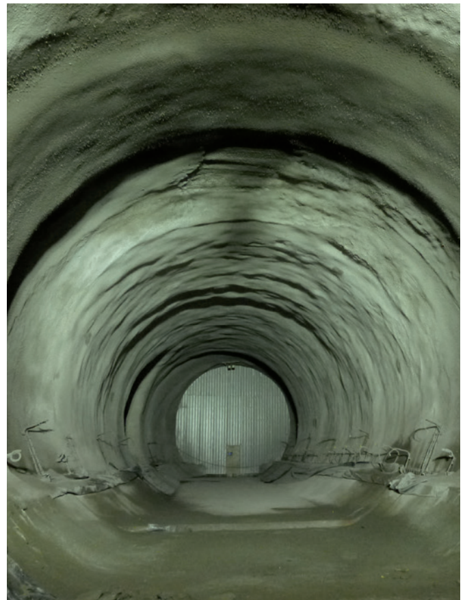
Permanent sprayed concrete lining with MasterSeal 345 waterproofing membrane